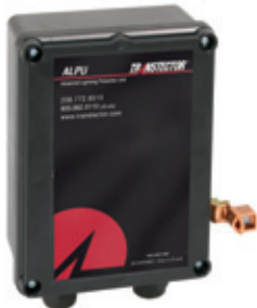
ALPU 1000BT-R 1101-778-2

Outdoor Cat5, 55 Vdc, GbE power over Ethernet protector, supports point-to-point and point-to-multi-point radios